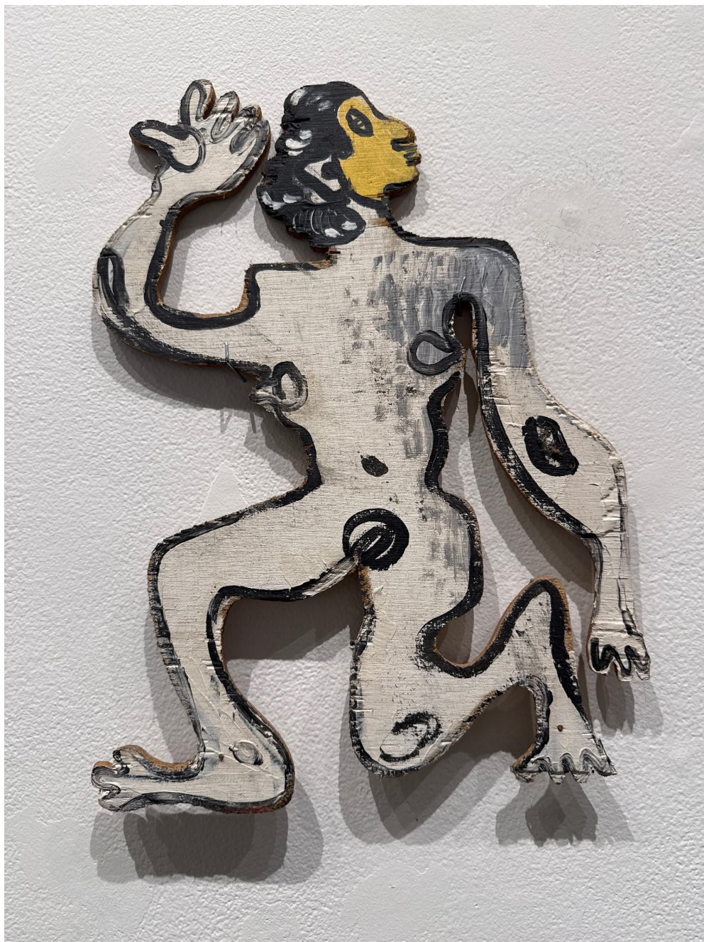
31. Lester Goldman Untitled Paint on wood $350 SOLD