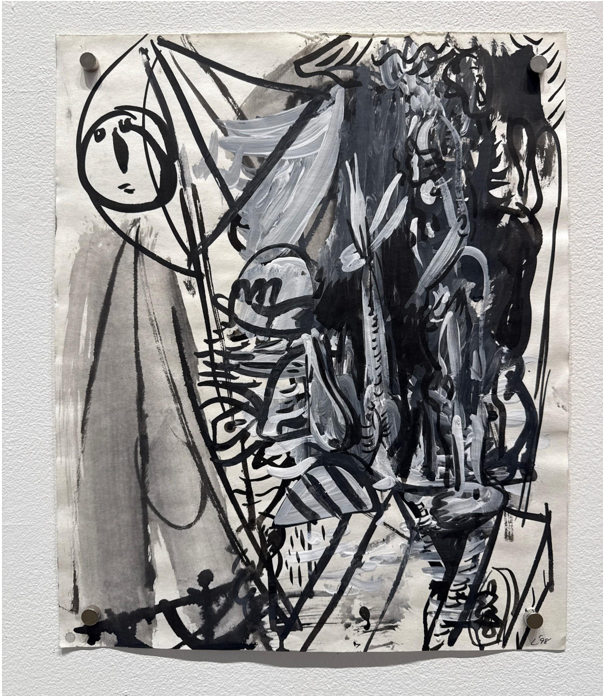
36. Lester Goldman Untitled Painting on paper 14" x 17" 1998 $1,500