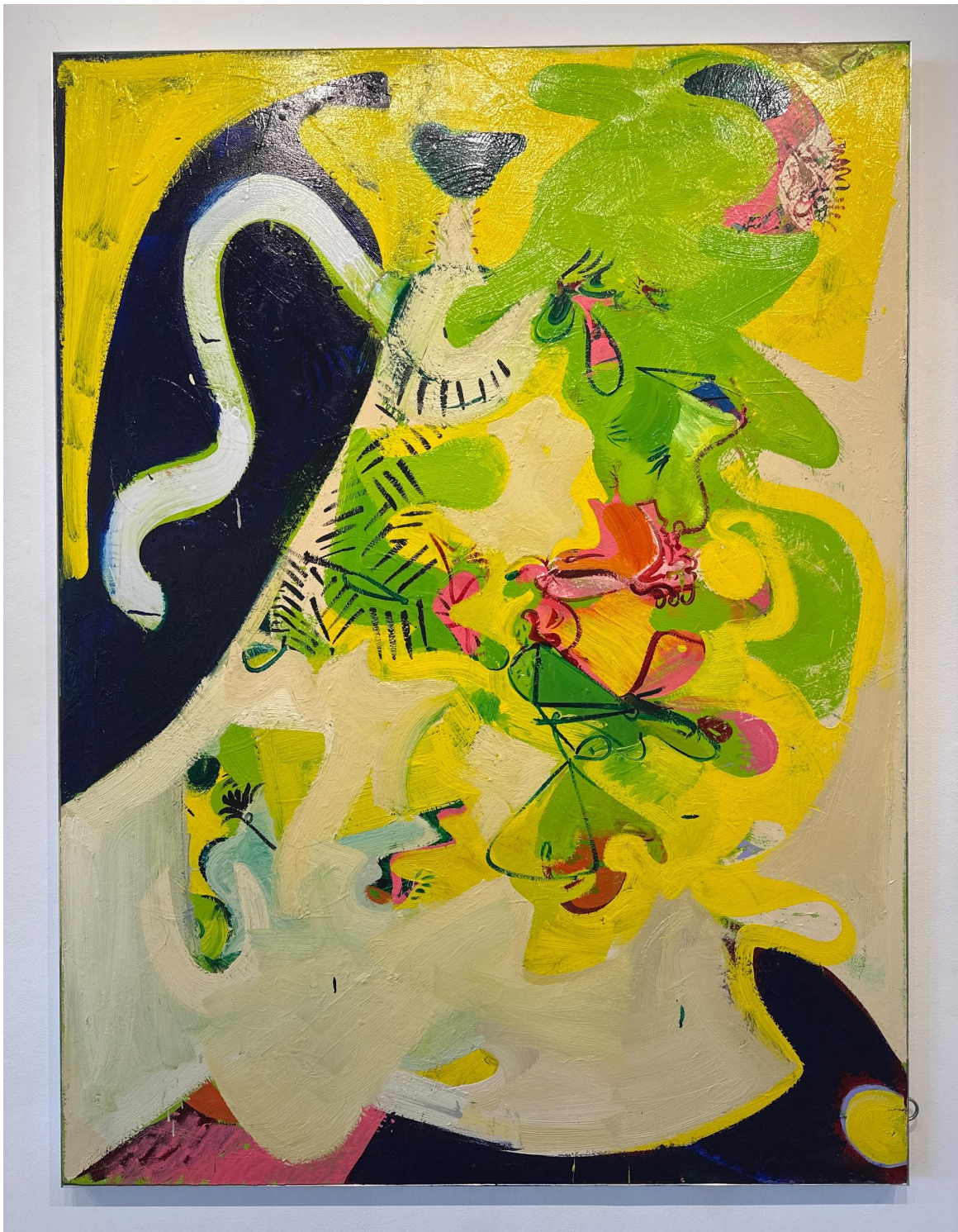
49. Lester Goldman The Tail of the I Oil on canvas 73" x 55" 1998 $20,000