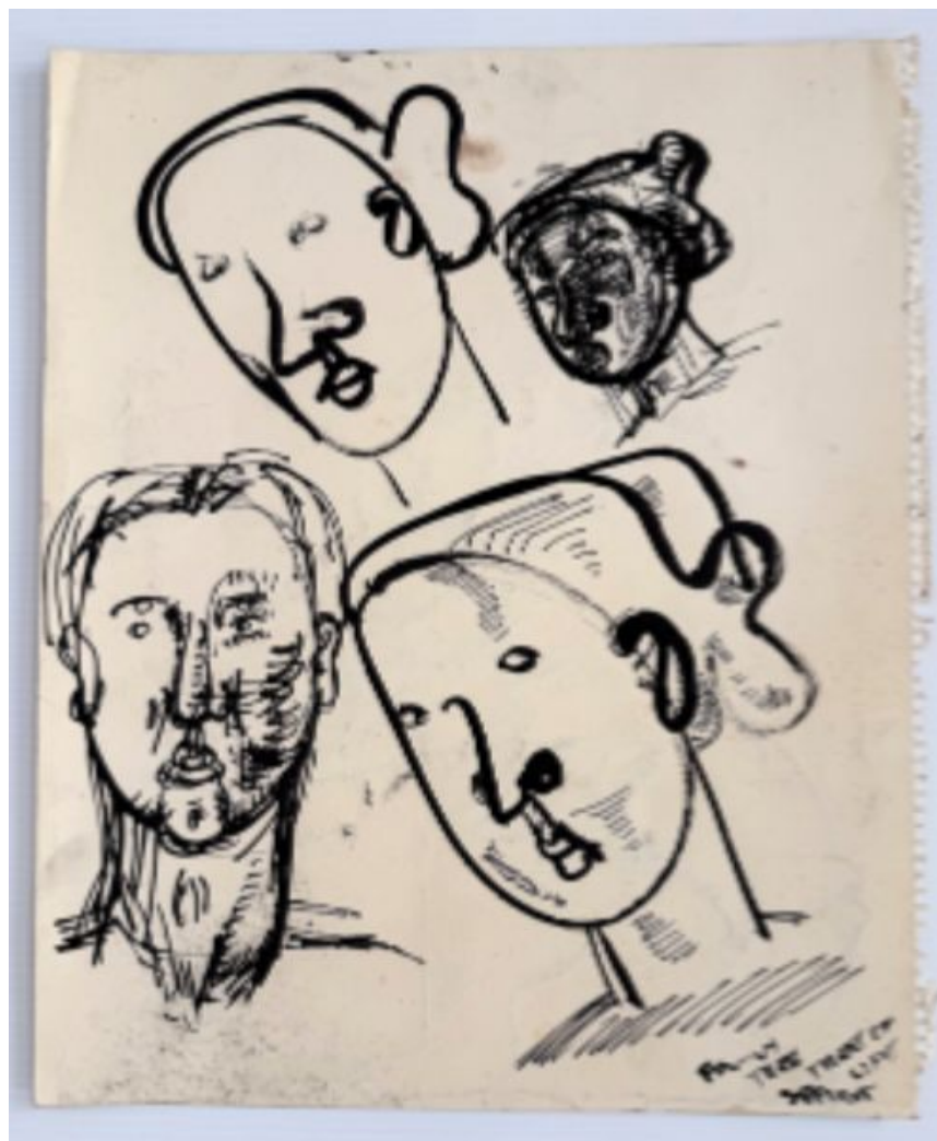
38. Lester Goldman Untitled (Two-sided sketchbook drawing) Mixed media 14" x 17" $350