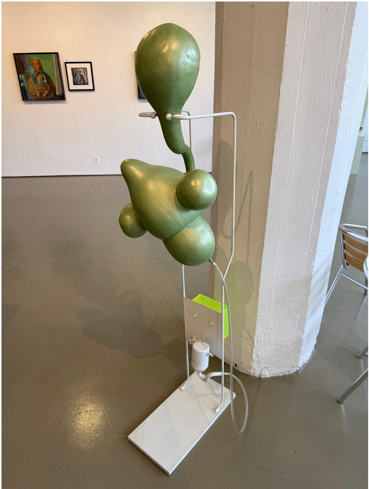
54. Lester Goldman Torso Tech Mixed media sculpture 2003 $7,000