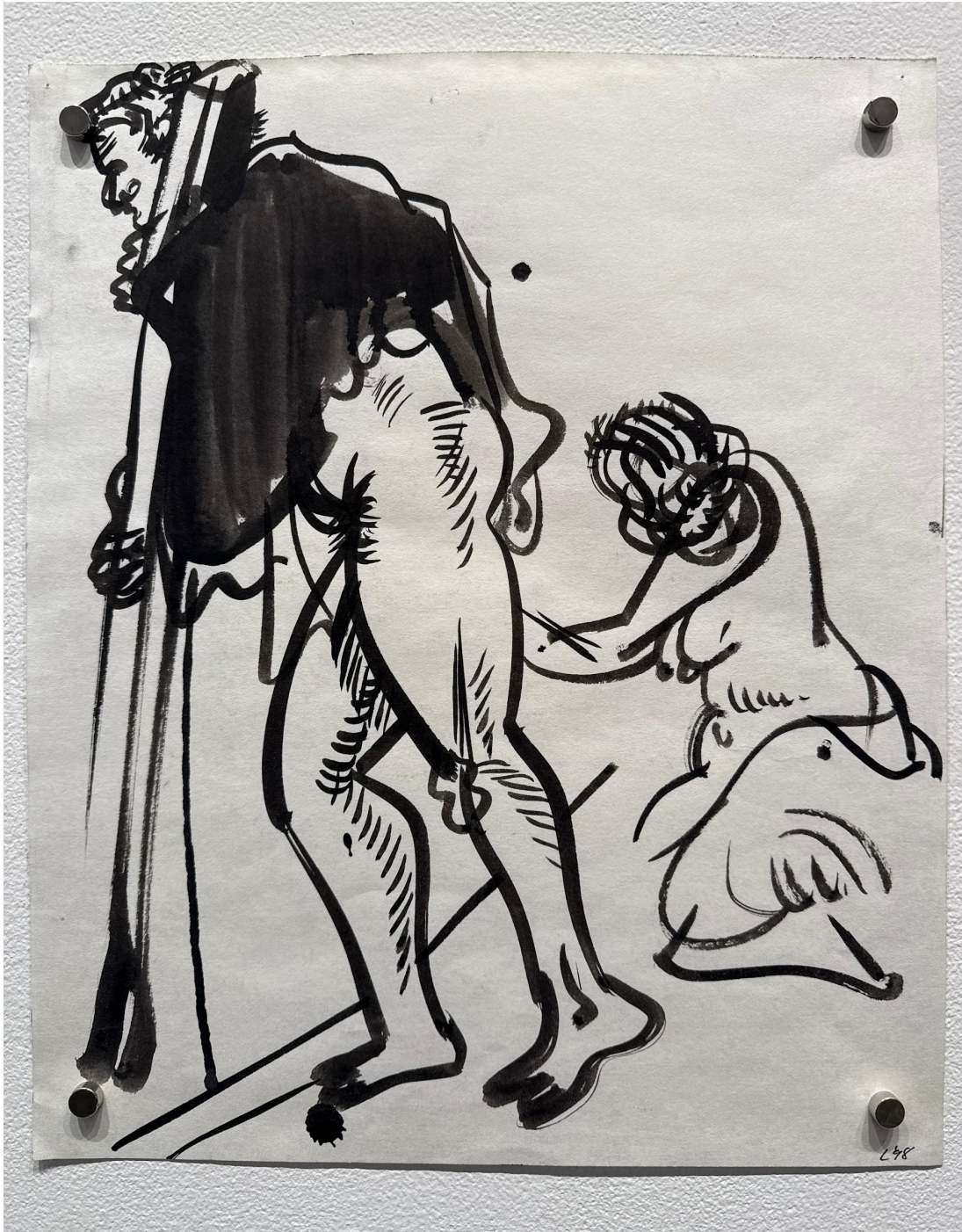
35. Lester Goldman Untitled painting on paper 14" x 17" $1,500