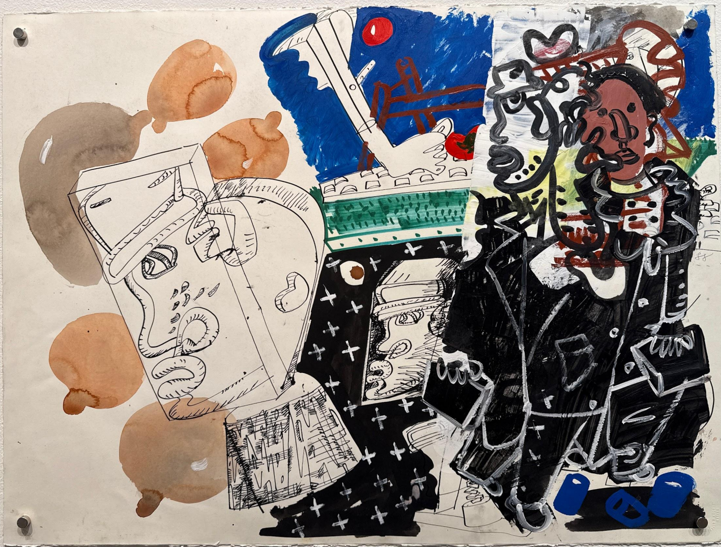
40. Lester Goldman Untitled Mixed media 30" x 22" $2,000